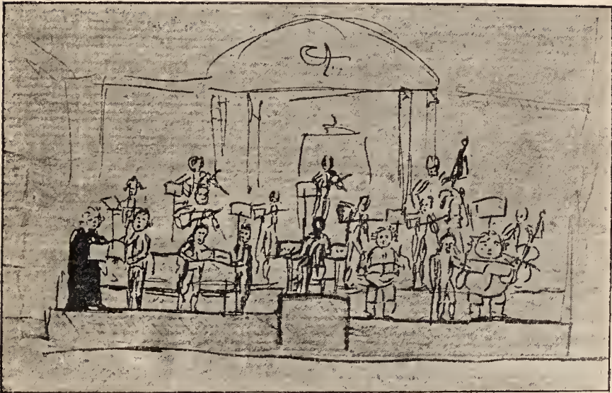
PEN AND INK SKETCH OF THE CONCERT GIVEN AT TRINITY HALL, CAMBRIDGE, JUNE 4, 1789.

The biographer of his grand-nephew may be permitted, however, to dwell, before passing from him, on some characteristic traits: (1) his persistence in companionship